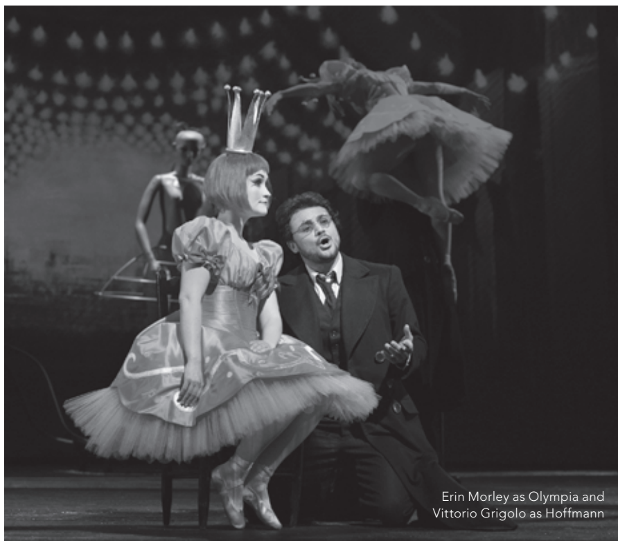
Erin Morley as Olympia and Vittorio Grigolo as Hoffmann