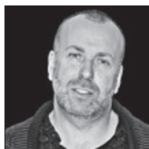
Sir David McVicar

CAREER HIGHLIGHTS In 2013, he became music director at the Glimmerglass Festival, where he has led Donizetti's L'Assedio di Calais , Rossini's La Gazza Ladra , La Bohème , Candide , Macbeth , and Madama Butterfly , among others. He was artistic director of West Australian Opera from 2012 to 2014, conducting Il Trovatore , Otello , and La Bohème , among others. He was a member of New York City Opera for 15 years, where he was named acting music director in 1995, and has been artistic director of opera at Mannes School of Music since 1998. He has also appeared at Atlanta Opera, Portland Opera, the Norwegian National Opera, and with the Tokyo Philharmonic Orchestra, Taiwan's National Symphony Orchestra, and Orchestra of St. Luke's.