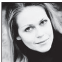
Kristine Opolais SOPRANO (RIGA, LATVIA)

CAREER HIGHLIGHTS Recent performances include Elisabetta in Maria Stuarda , Kundry, and Brangäne at the Royal Swedish Opera; Brangäne at the Greek National Opera; Ortrud in Lohengrin in Amsterdam; and Brünnhilde at the Bavarian State Opera. She has also sung the title roles of Elektra and Carmen , Maddalena in Andrea Chénier , and Brünnhilde in Ring performances at the Royal Swedish Opera; Brünnhilde in Siegfried at the Aix-en-Provence Festival; Desdemona in Otello , Eva in Die Meistersinger von Nürnberg , and Elisabeth in Tannhäuser in Stuttgart; Brünnhilde in Ring performances at the Vienna State Opera; Marie at Covent Garden and in Paris; Ariadne in Ariadne auf Naxos in Paris, Brussels, Dresden, and Munich; Judith in Bluebeard's Castle at Covent Garden; and Kundry at the Paris Opera.