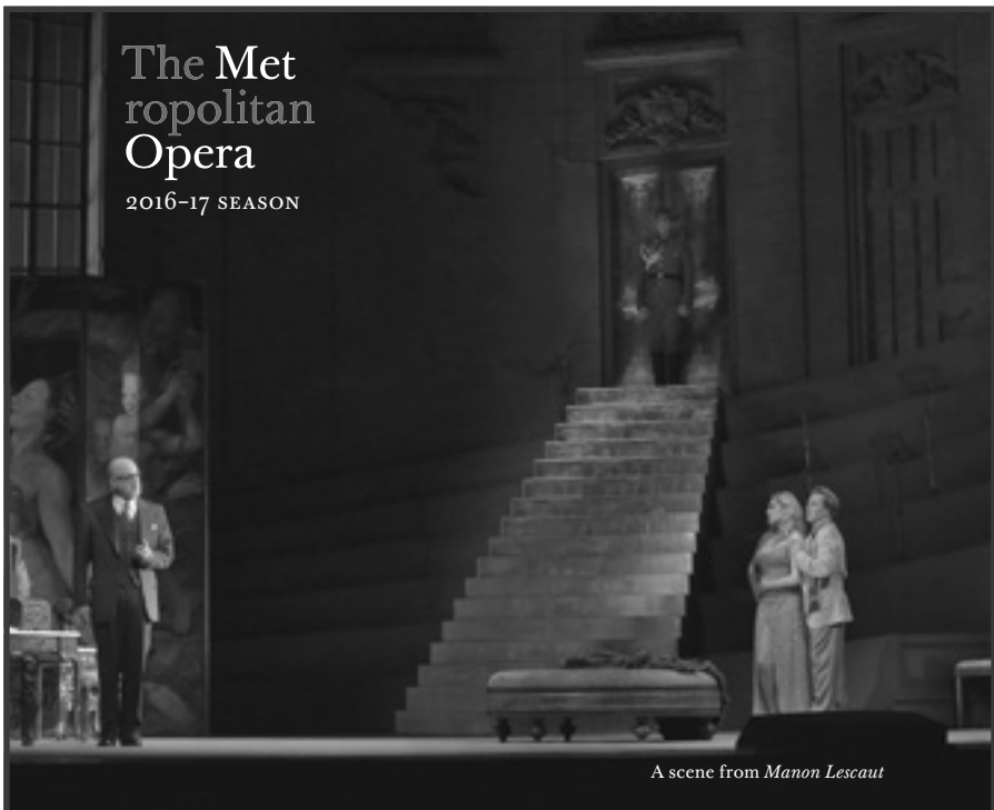
A scene from Manon Lescaut

The Metropolitan Opera is pleased to salute Arconic Foundation in recognition of its generous support during the 2016-17 season.