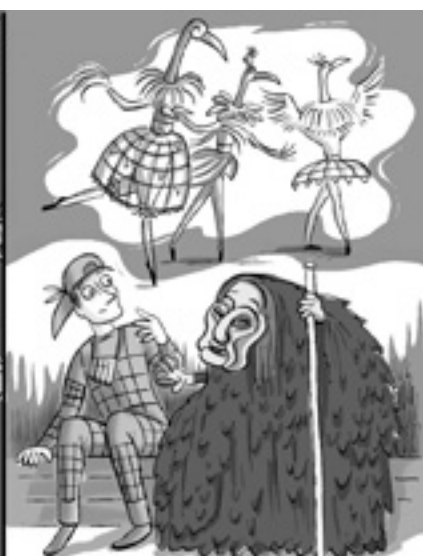
An old lady appears and flirts with Papageno, and although he would prefer a better match, he eventually agrees to be faithful to her. The old lady is suddenly transformed into the beautiful Papagena, but then disappears.