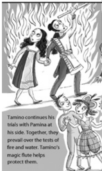
Tamino continues his trials with Papagena at his side. Together, they prevail over the tests of fire and water. Tamino's magic flute helps protect them.