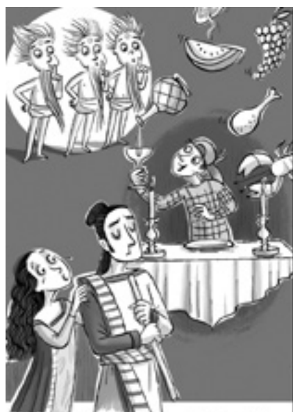
Tamino and Papageno begin their trials together, but Papageno soon becomes distracted. Tamino continues on with the help of the three spirits.