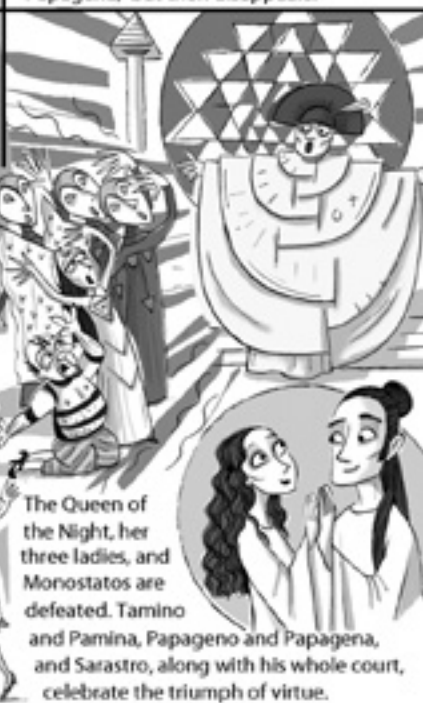
The Queen of the Night, her three ladies, and Monostatos are defeated. Tamino and Papagena, Papageno and Papagena, and Sarastro, along with his whole court, celebrate the triumph of virtue.