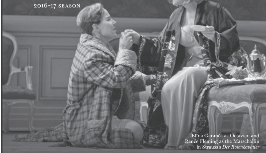
Elina Garanča as Octavian and Renée Fleming as the Marschallin in Strauss's Der Rosenkavalier

The Metropolitan Opera is pleased to salute Toll Brothers in recognition of its generous support during the 2016-17 season.