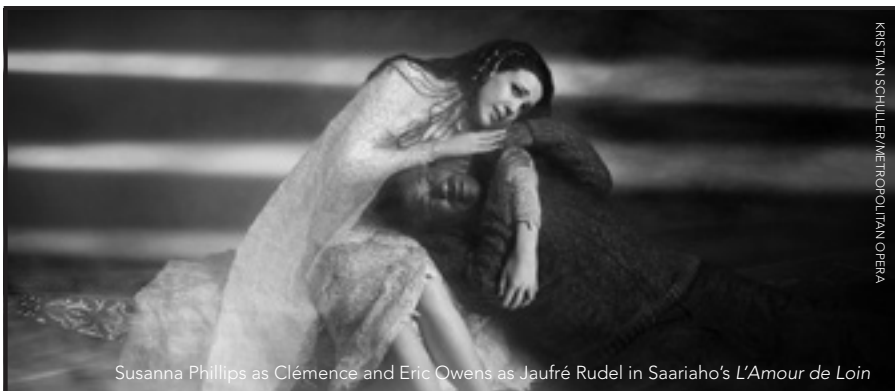
Susanna Phillips as Clémence and Eric Owens as Jaufré Rudel in Saariaho's L'Amour de Loïn