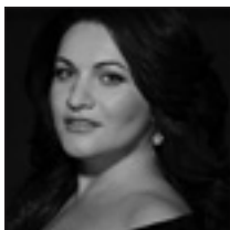
Hibla Gerzmava SOPRANO (PITSUNDA, RUSSIA)

CAREER HIGHLIGHTS From 1999 to 2008 he was general music director at Oper Frankfurt, where he conducted Der Fliegende Holländer , Luisa Miller , Un Ballo in Maschera , and Tristan und Isolde , among other works. Recent performances include Il Trovatore , Nabucco , Macbeth , La Traviata , and Nabucco at Munich's Bavarian State Opera, Turandot at the Bregenz Festival, Guillaume Tell at the Netherlands Opera, Nabucco in Tokyo, La Fanciulla del West at the Vienna State Opera, and Mascagni's L'Amico Fritz in Strasbourg. He has also conducted at the Staatsoper Berlin, Deutsche Oper Berlin, Covent Garden, Paris Opera, Barcelona's Liceu, and at festivals in Glyndebourne, Spoleto, Schleswig-Holstein, and Pesaro.