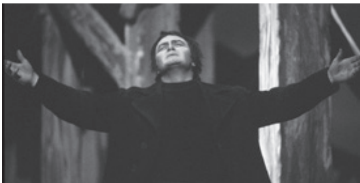
Clockwise from top: In the title role of Britten's Peter Grimes (1967), as Aeneas in Berlioz's Les Troyens (1973), and in the title role of Otello (1972)

Jon Vickers, who died last July at age 88, was one of the 20th century's legendary tenors. The title role of Otello , which he sang more than 30 times at the Met over his 27-year career here, was just one of 17 characters he portrayed for the company, starting with his 1960 debut as Canio in Pagliacci . Whether as Parsifal, Peter Grimes, Florestan in Fidelio , Siegmund in Die Walküre , or any number of other roles with which he was closely identified, Vickers brought unparalleled dramatic intensity and a voice of thrilling power and communicative skill to his interpretations. In a review of his first Met Grimes, in 1967, the Saturday Review called his performance, "not merely a career peak for this enormously gifted individual, but very likely the best embodiment of the part that the stage has yet known... The end result is something of a rarity on the operatic stage: a virtuoso performance of a far-from-simple vocal task combined with a powerful involvement in the human condition that spells his life or death." Later, Newsday summed up his artist persona nicely, calling Vickers, "a volcanic force." His colleagues agreed, with Met Music Director James Levine asserting, "such a beautiful voice and such intensity in every respect... a truly great artist."