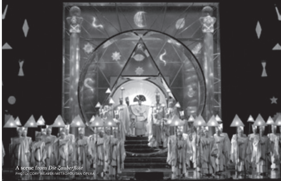
A scene from Die Zauberflöte