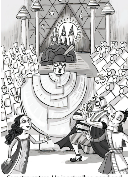
Sarastro enters. He is actually a good and just ruler, and he punishes Monostatos for his bad behavior and promises to set Pamina free. But first, Tamino must undergo a series of trials and tests.