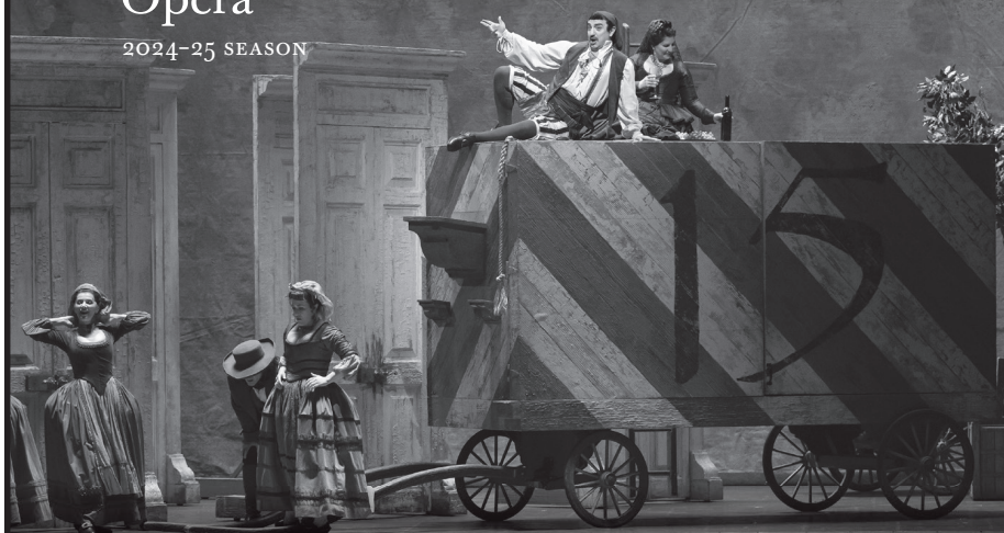
A scene from Rossini's Il Barbiere di Siviglia

The Metropolitan Opera is pleased to salute Bloomberg Philanthropies in recognition of its generous support during the 2024-25 season.