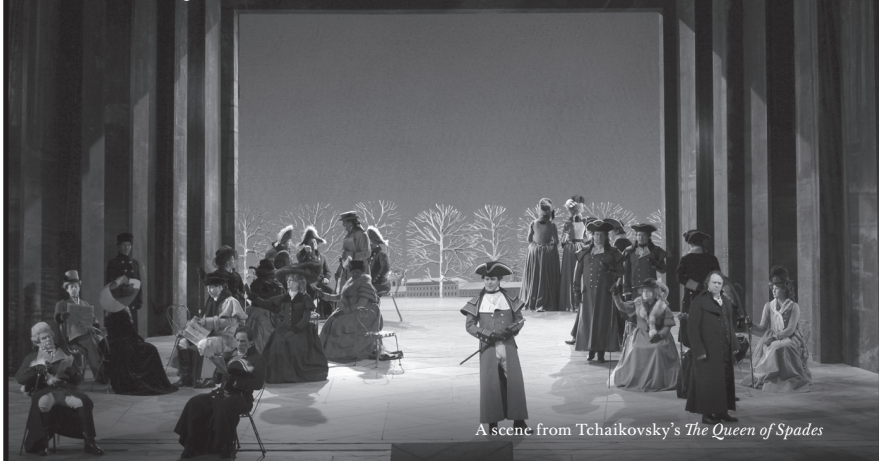
A scene from Tchaikovsky's The Queen of Spades

The Metropolitan Opera is pleased to salute Mastercard in recognition of its generous support during the 2024-25 season.