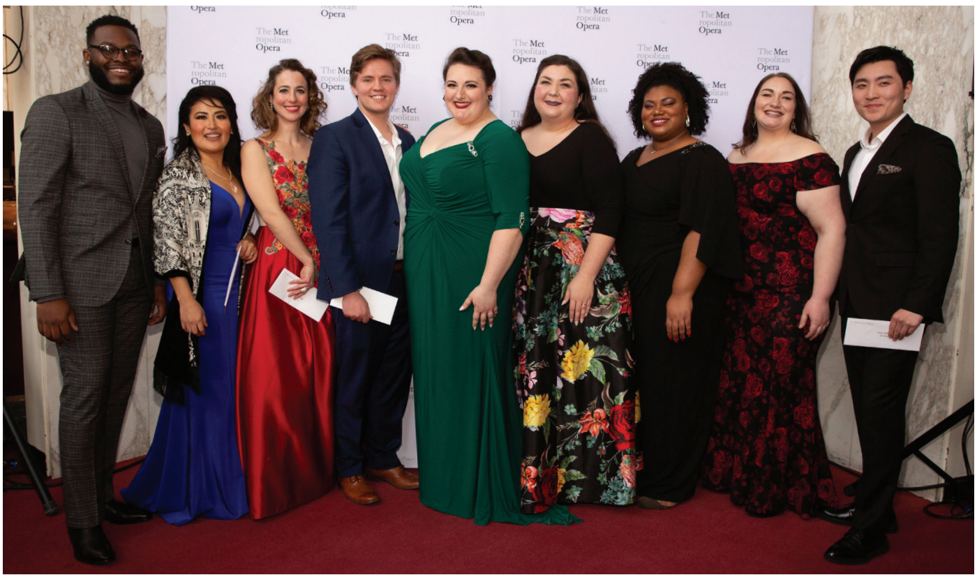
The 2020 National Council Finalists