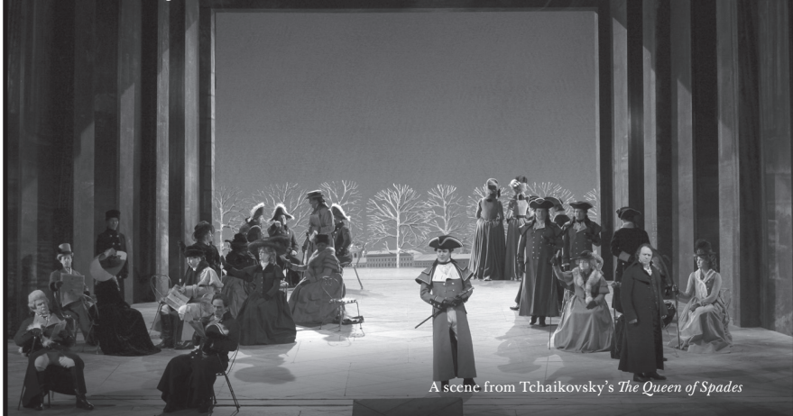
A scene from Tchaikovsky's The Queen of Spades

The Metropolitan Opera is pleased to salute Mastercard in recognition of its generous support during the 2024-25 season.