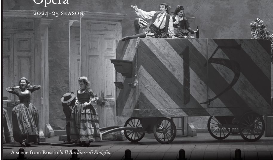
A scene from Rossini's Il Barbiere di Siviglia

The Metropolitan Opera is pleased to salute Bloomberg Philanthropies in recognition of its generous support during the 2024-25 season.