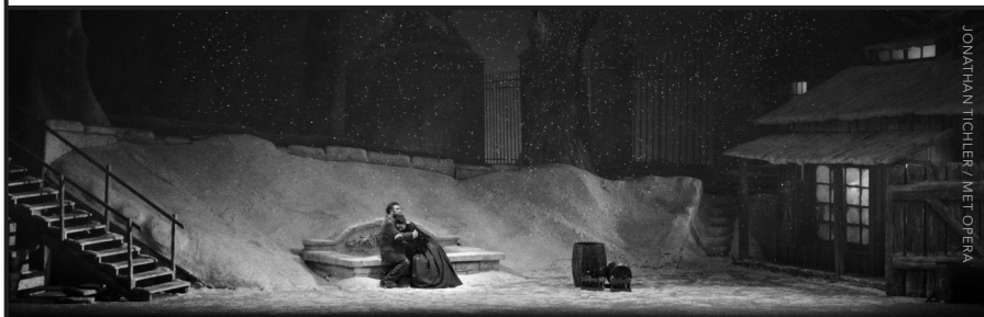
A scene from Puccini's La Bohème