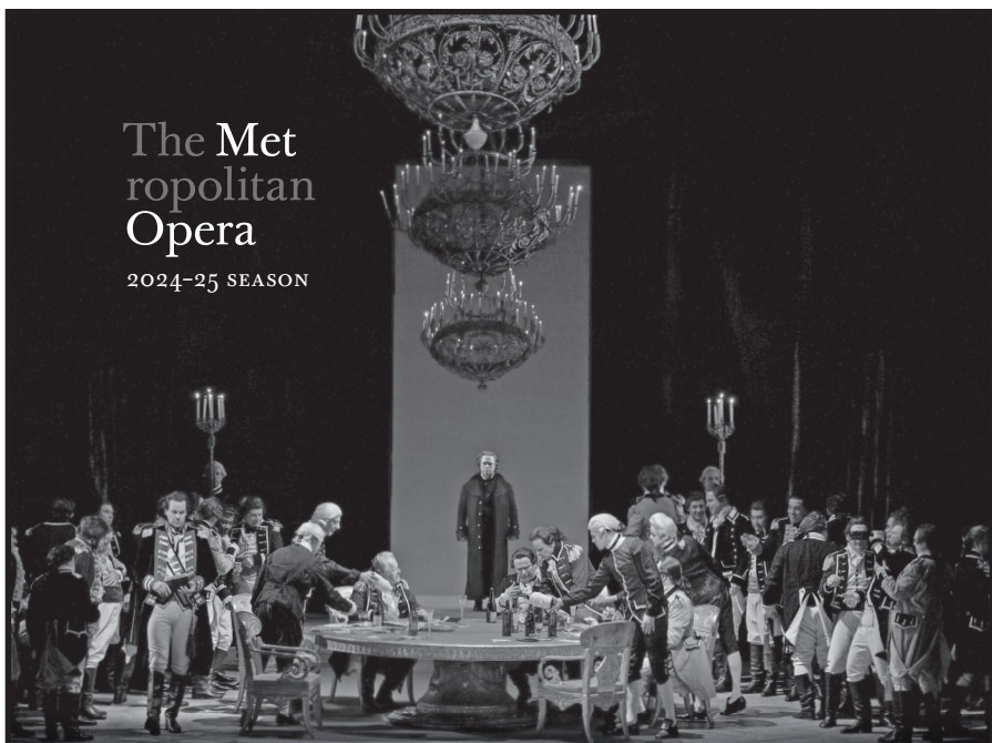
A scene from Tchaikovsky's The Queen of Spades

The Metropolitan Opera is pleased to salute Rolex in recognition of its generous support during the 2024-25 season.