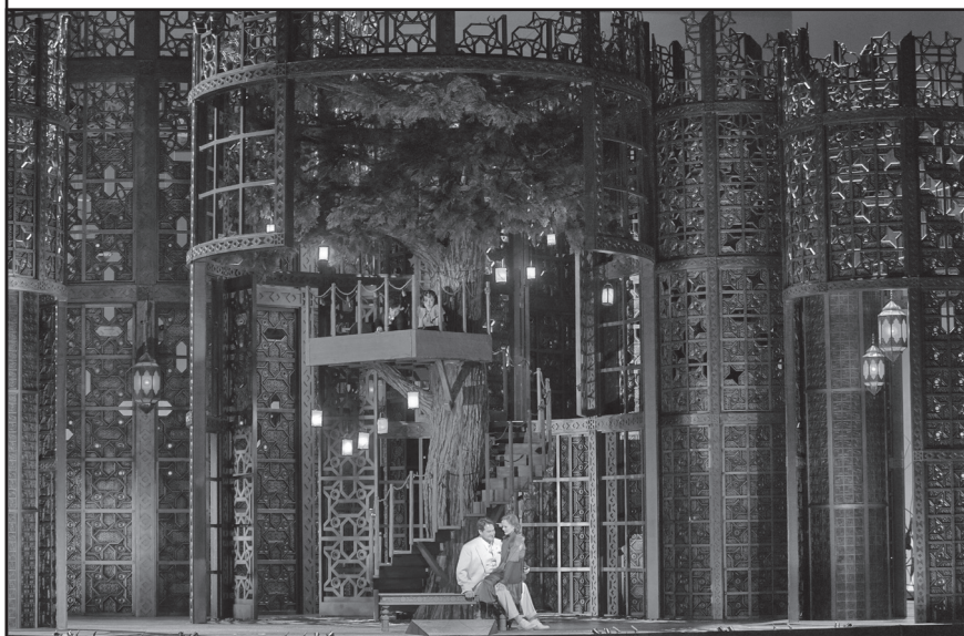
KEN HOWARD / MET OPERA