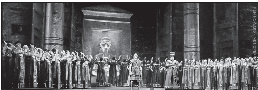
A scene from Verdi's Aida