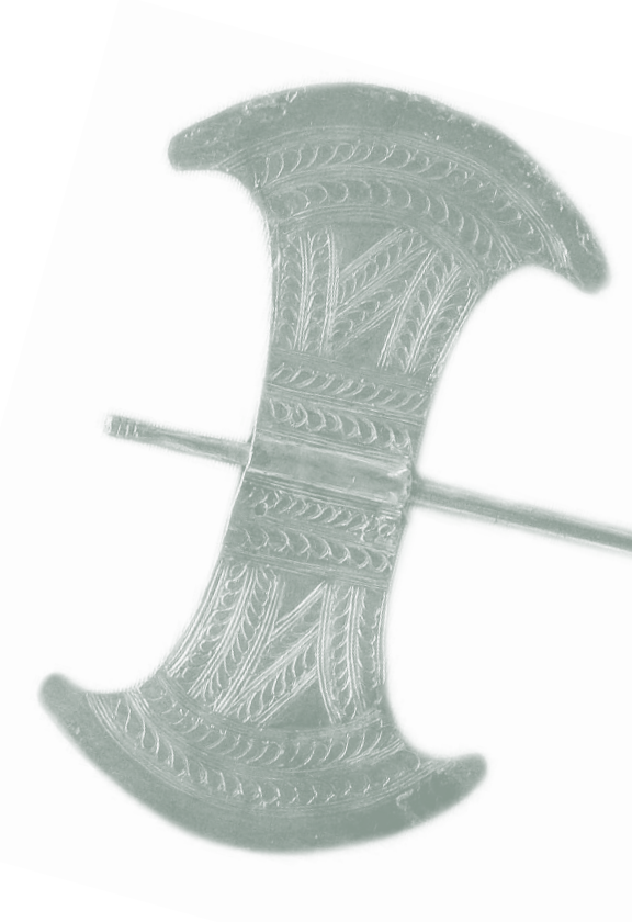
A Minoan labrys , or double axe, from the Archaeological Museum in Herakleion.