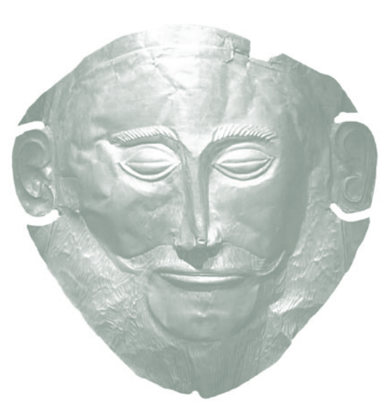
The Mask of Agamemnon, a funeral mask in gold, ca. 1550–1500 BC, from Mycenae