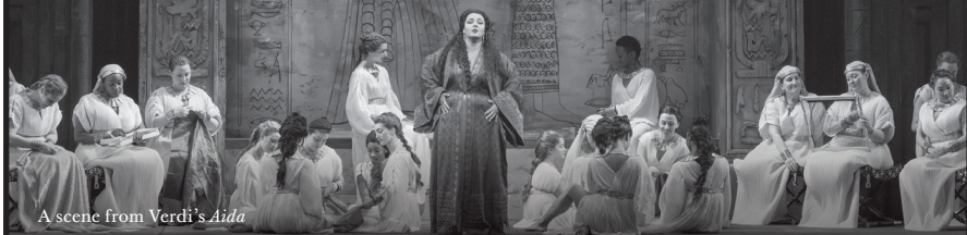
A scene from Verdi's Aida

The Metropolitan Opera is pleased to salute Bloomberg Philanthropies in recognition of its generous support during the 2024–25 season.