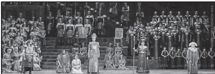
A scene from Verdi's Aida