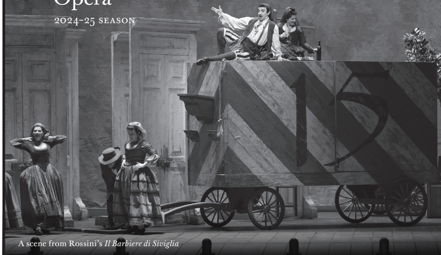
A scene from Rossini's Il Barbiere di Siviglia

The Metropolitan Opera is pleased to salute Bloomberg Philanthropies in recognition of its generous support during the 2024-25 season.