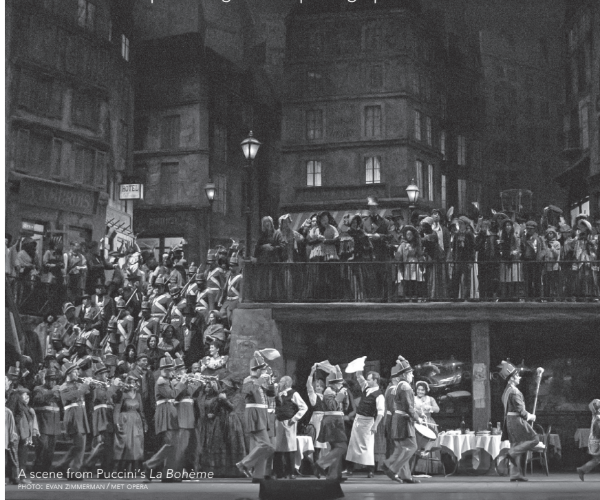
A scene from Puccini's La Bohème

Make a planned gift to help bring opera to the world.