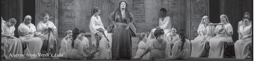
A scene from Verdi's Aida

The Metropolitan Opera is pleased to salute Bloomberg Philanthropies in recognition of its generous support during the 2024-25 season.