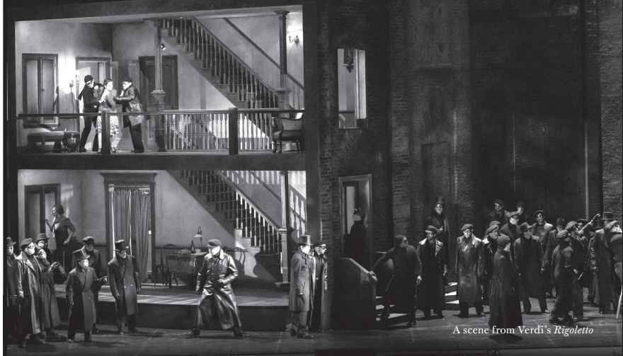
A scene from Verdi's Rigoletto

The Metropolitan Opera is pleased to salute Viking in recognition of its generous support during the 2024-25 season.