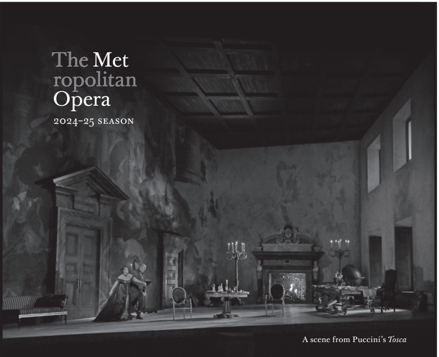
A scene from Puccini's Tosca

The Metropolitan Opera is pleased to salute Mastercard in recognition of its generous support during the 2024-25 season.