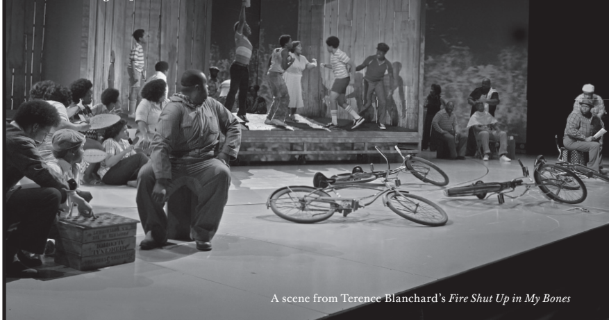
A scene from Terence Blanchard's Fire Shut Up in My Bones

The Metropolitan Opera is pleased to salute Mastercard in recognition of its generous support during the 2023-24 season.