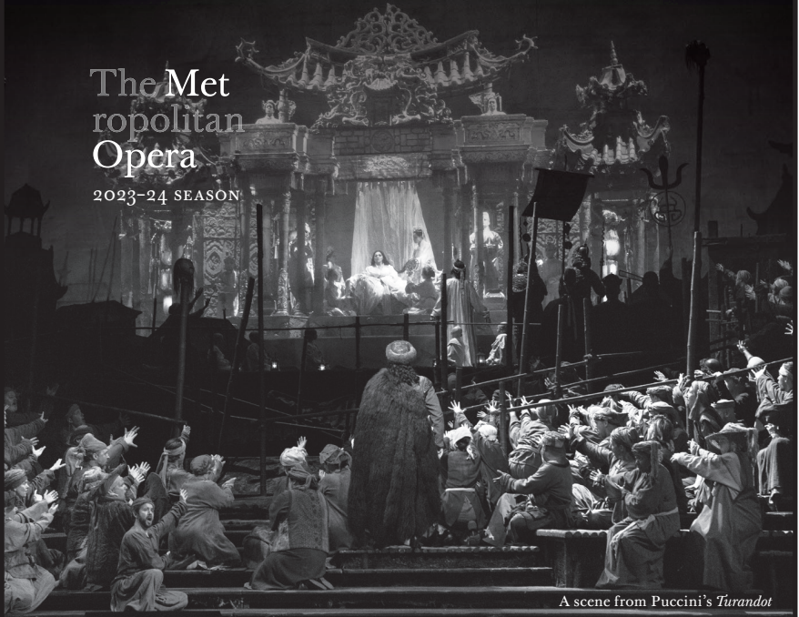
A scene from Puccini's Turandot

The Metropolitan Opera is pleased to salute Bloomberg Philanthropies in recognition of its generous support during the 2023-24 season.