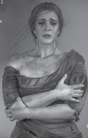
Lise Davidsen as Leonora in Verdi's La Forza del Destino

The Metropolitan Opera is pleased to salute Rolex in recognition of its generous support during the 2023-24 season.