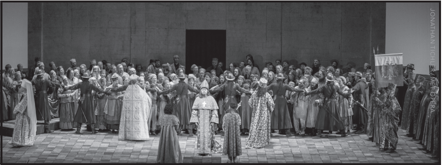
JONATHAN TITHEL / MET OPERA