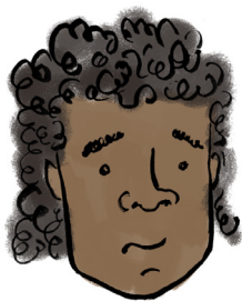
Werther A young poet