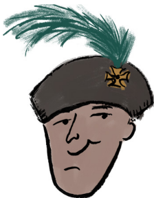
Njegus Baron Zeta's assistant