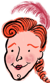
Valencienne Zeta Baron Zeta's wife, in love with Camille de Rosillon