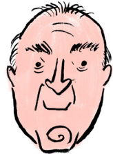
Baron Mirko Zeta Pontevedro's ambassador in Paris