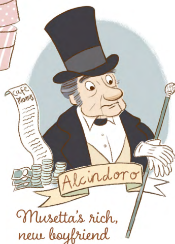
Musetta's rich, new boyfriend