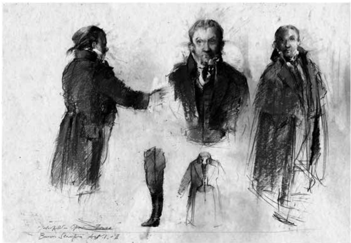
Costume sketches for Cavaradossi and Scarpia