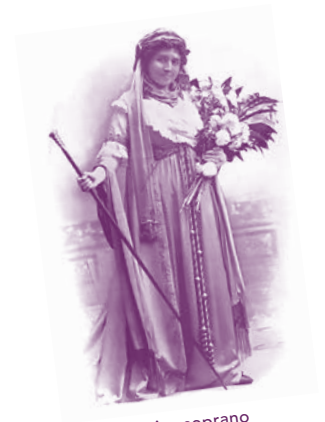
Croatian soprano Milka Ternina was the Met's first Tosca in 1901.