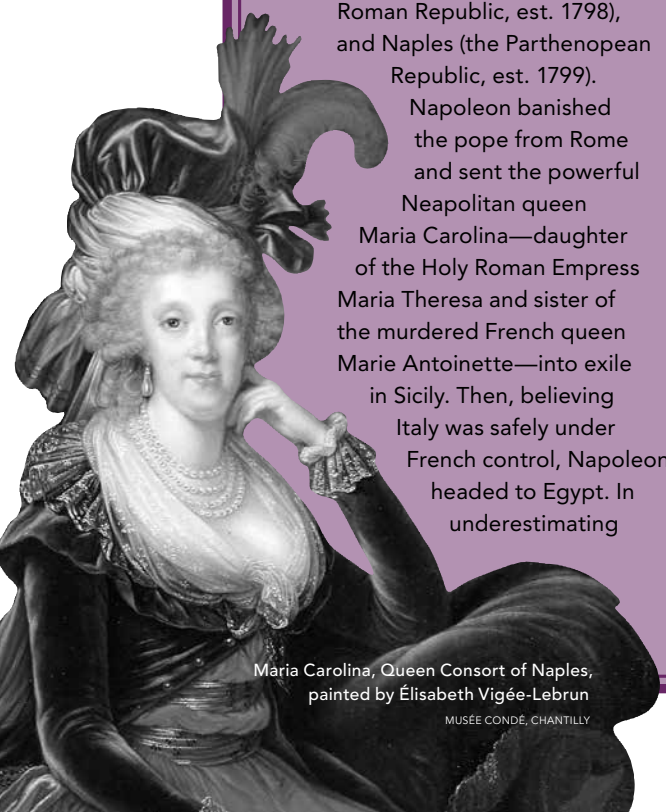
Maria Carolina, Queen Consort of Naples, painted by Élisabeth Vigée-Lebrun