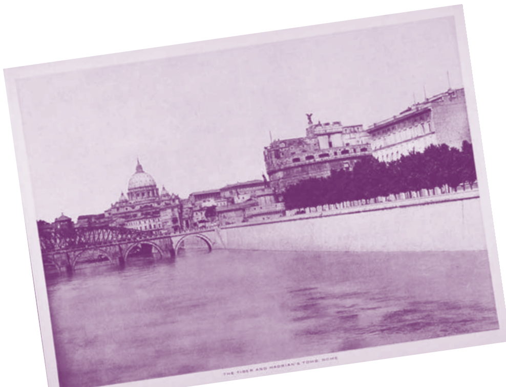
The Castel Sant'Angelo, located to the right of center in this historical photograph, is the setting for Act III.

Cavaradossi, in despair, is imprisoned. Tosca arrives and explains what has happened and how they will escape. She watches as the soldiers take aim and fire. Tosca rushes to Cavaradossi's side—and discovers Scarpia's final cruel trick: The bullets were real, and Cavaradossi is dead. Vowing to confront Scarpia before God, Tosca climbs to the top of the prison walls and throws herself to her death.