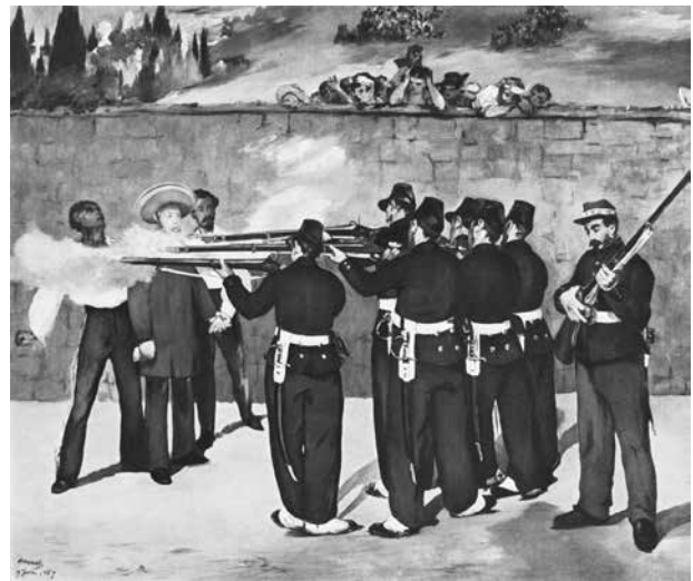
Édouard Manet’s Execution of Emperor Maximilian

Yet Tosca is not a story of dire poverty or social ills, as most of the characters come from noble families. Nevertheless, Puccini wished to tell his story as realistically as possible, and in this case, that meant including sounds that would make the opera seem true to life.