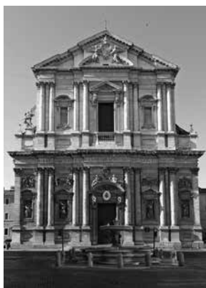
Sant'Andrea della Valle (Act I)

You are a world-famous travel writer, and you have been asked to write a guidebook for the places featured in Tosca . Based on what you see in the Live in HD production, describe the interiors of the church of Sant'Andrea della Valle (Act I), the Palazzo Farnese (Act II), and the Castel Sant'Angelo (Act III) as though you are telling a future visitor what to look at. Then point out a few important things that “happened” at that location, for instance “notice the Attavanti chapel, with a painting by the great artist Mario Cavaradossi,” or “above your heads, you’ll see the parapet from which the famous soprano Floria Tosca jumped to her death.”