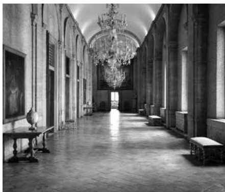
The Palazzo Farnese (Act II)