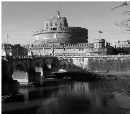
The Castel Sant'Angelo (Act III)