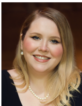
Emily Treigle Mezzo-Soprano Gulf Coast