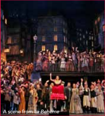
A scene from La Bohème