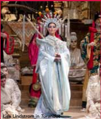
Lise Lindstrom in Turandot