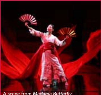
A scene from Madama Butterfly