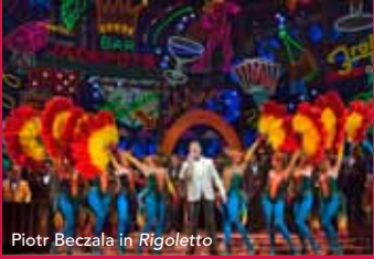
Piotr Beczala in Rigoletto