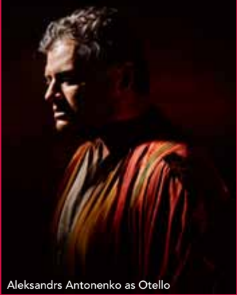
Aleksandrs Antonenko as Otello