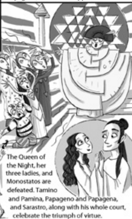
The Queen of the Night, her three ladies, and Monostatos are defeated. Tamino and Pamina, Papageno and Papagena, and Sarastro, along with his whole court, celebrate the triumph of virtue.