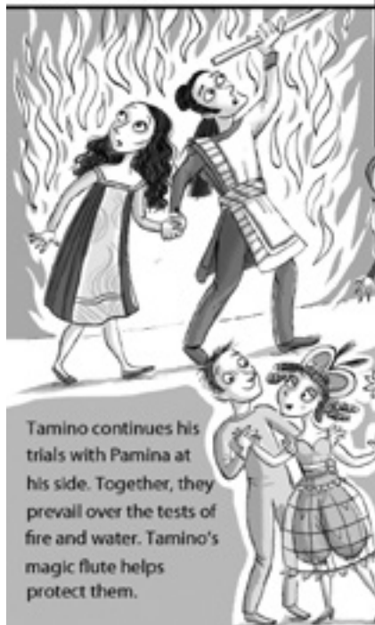
Tamino continues his trials with Pamina at his side. Together, they prevail over the tests of fire and water. Tamino's magic flute helps protect them.