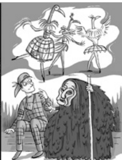
An old lady appears and flirts with Papageno, and although he would prefer a better match, he eventually agrees to be faithful to her. The old lady is suddenly transformed into the beautiful Papagena, but then disappears.