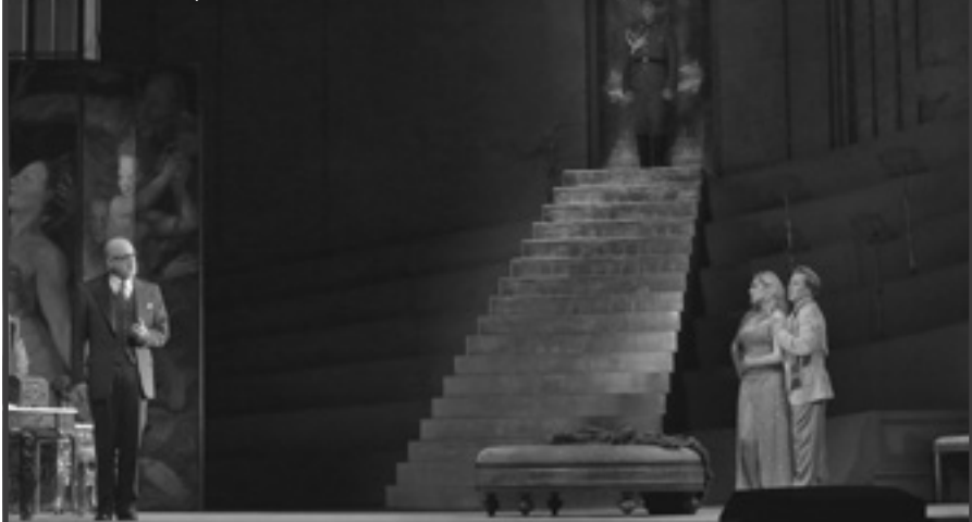
A scene from Manon Lescaut

The Metropolitan Opera is pleased to salute Arconic Foundation in recognition of its generous support during the 2016-17 season.