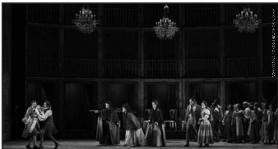
A scene from Mozart's Don Giovanni