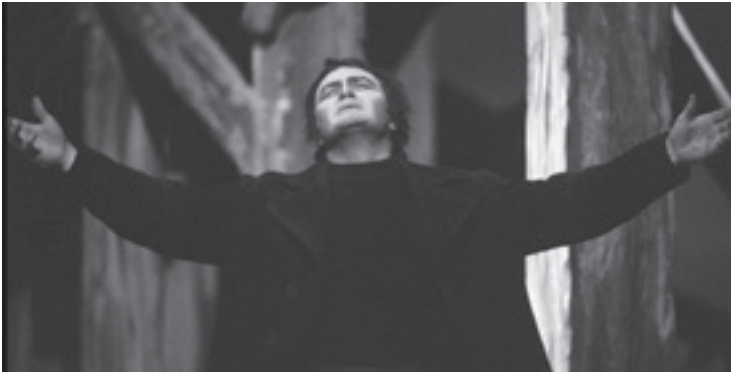
Clockwise from top: In the title role of Britten's Peter Grimes (1967), as Aeneas in Berlioz's Les Troyens (1973), and in the title role of Otello (1972)

Jon Vickers, who died last July at age 88, was one of the 20th century's legendary tenors. The title role of Otello , which he sang more than 30 times at the Met over his 27-year career here, was just one of 17 characters he portrayed for the company, starting with his 1960 debut as Canio in Pagliacci . Whether as Parsifal, Peter Grimes, Florestan in Fidelio , Siegmund in Die Walküre , or any number of other roles with which he was closely identified, Vickers brought unparalleled dramatic intensity and a voice of thrilling power and communicative skill to his interpretations. In a review of his first Met Grimes, in 1967, the Saturday Review called his performance, "not merely a career peak for this enormously gifted individual, but very likely the best embodiment of the part that the stage has yet known... The end result is something of a rarity on the operatic stage: a virtuoso performance of a far-from-simple vocal task combined with a powerful involvement in the human condition that spells his life or death." Later, Newsday summed up his artist persona nicely, calling Vickers, "a volcanic force." His colleagues agreed, with Met Music Director James Levine asserting, "such a beautiful voice and such intensity in every respect... a truly great artist."