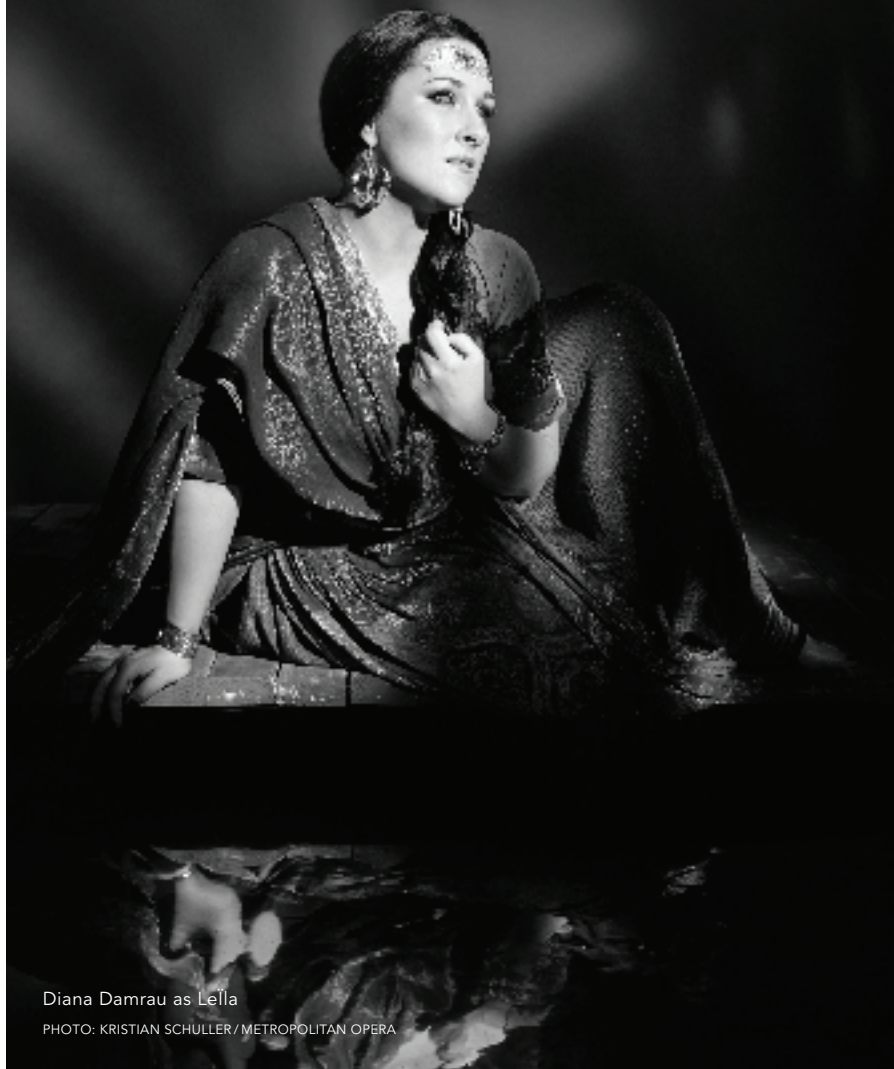
Diana Damrau as Lella