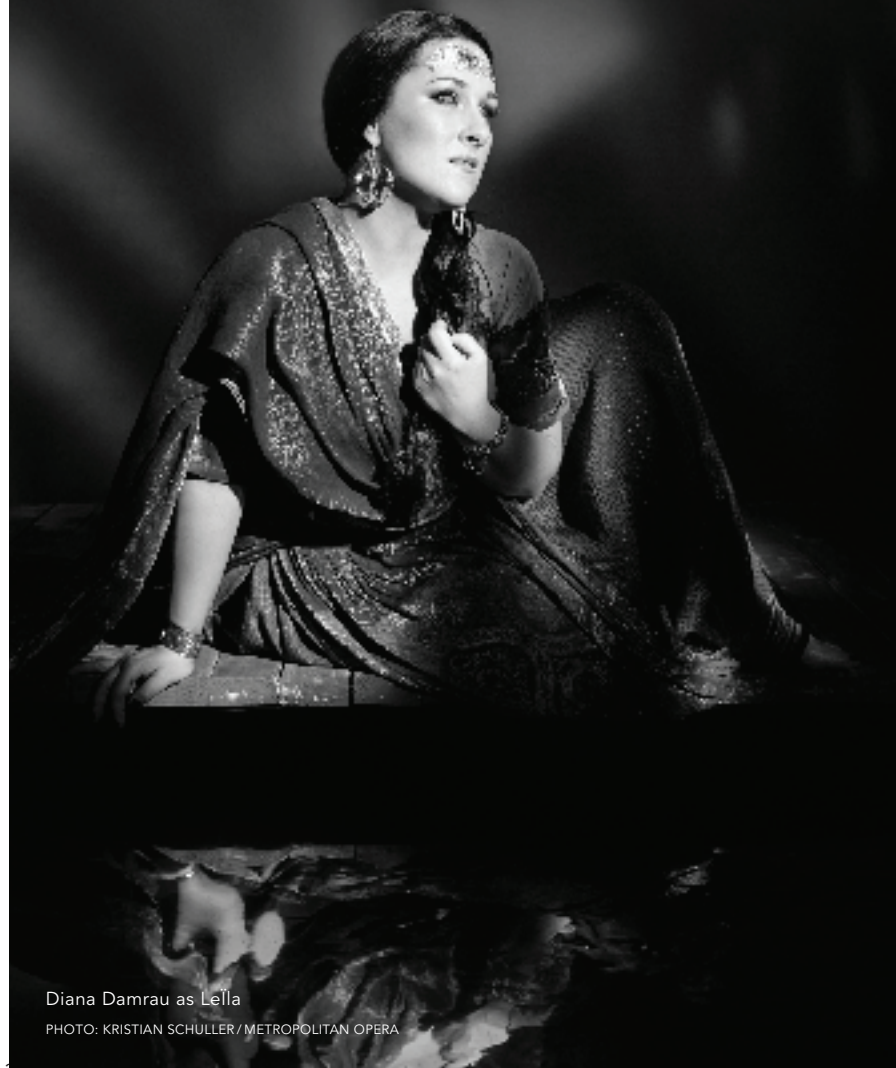
Diana Damrau as Lella