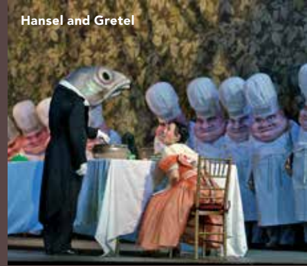
Hansel and Gretel