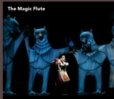
The Magic Flute