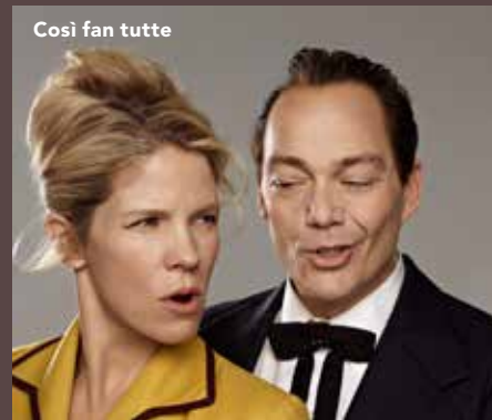
Cosi fan tutte