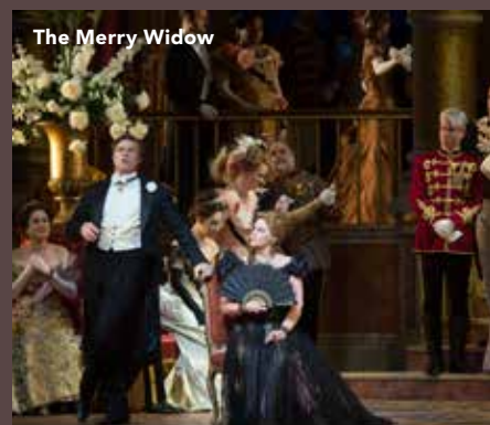
The Merry Widow